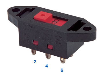
115/230 is preferred