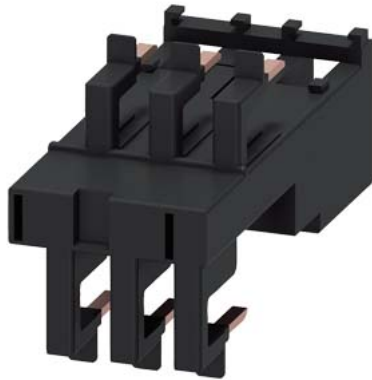
Link module spring-type Electrical and mechanical for 3RV2.21 and 3RT2.2.