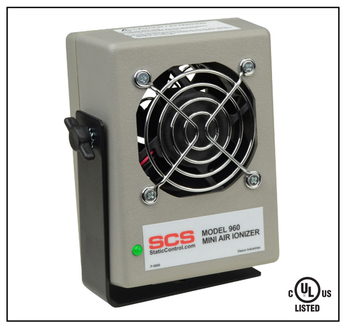
Figure 1. SCS 960 Mini Air Ionizer