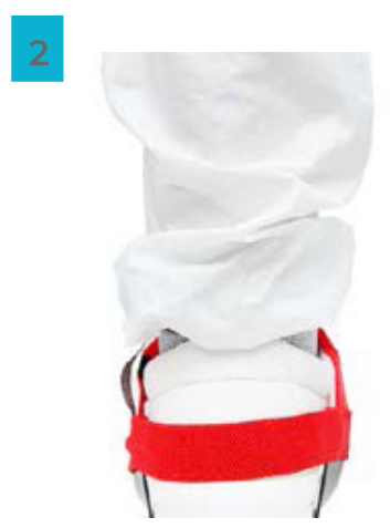
Place the Red Elastic Strip at the back of the shoe.