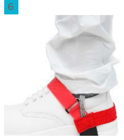
The footwear is now ready to be tested before entering a static sensitive area. Repeat with other

Important Notice: This data sheet and its contents (the "Information") belong to Antistat or are licensed to it. No licence is granted for the use of it other than for information purposes in connection with the products to which it relates. No licence of any intellectual property rights is granted. The Information is subject to change without notice and replaces all data sheets previously supplied. The Information supplied is believed to be accurate but Antistat assumes no responsibility for its accuracy or completeness, any error in or omission from it or for any use made of it. Users of this data sheet should check for themselves the Information and the suitability of the products for their purpose and not make any assumptions based on information included or omitted. Liability for loss or damage resulting from any reliance on the Information or use of it (including liability resulting from negligence or where Antistat was aware of the possibility of such loss or damage arising) is excluded. © Antistat 2020.