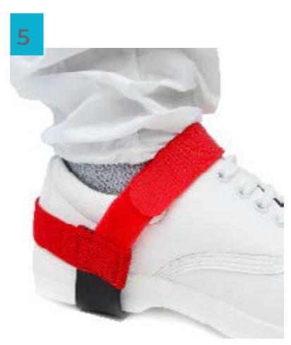
Inspect the Heel grounder for a secure and comfortable fit by gently tugging on the straps.