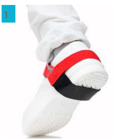
Remove Heel Grounder from its packaging and place the Black Conductive Rubber Strip on the heel grip of the shoe.