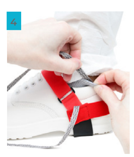
Feed the Grey Conductive Ribbon into the sock or shoe to complete the grounding path.