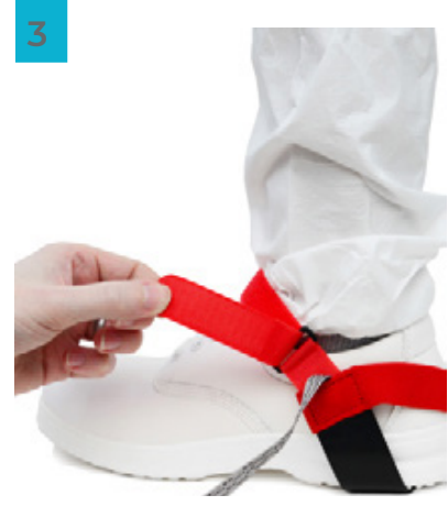
Feed the Hook and Loop Fastening through the Black Plastic Buckle, pull tight and press down to hold the strap in place.