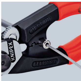
Crimping of the end caps on the Bowden cable sheath