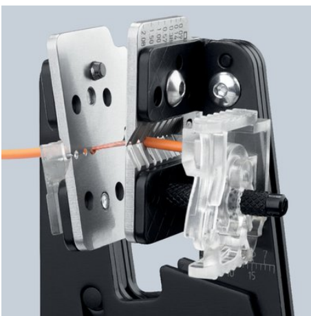
Positive stripping thanks to precise shape of the blades

Kapton® is a registered trademark of E. I. du Pont de Nemours and Company Radox® is a registered trademark of Huber & Suhner AG