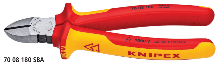
70 08 180 SBA