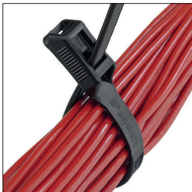
Design provides for an optional threading position that allows releasable, temporary bundling