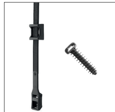
Retaining tab, within window of mounts, holds cable tie in position