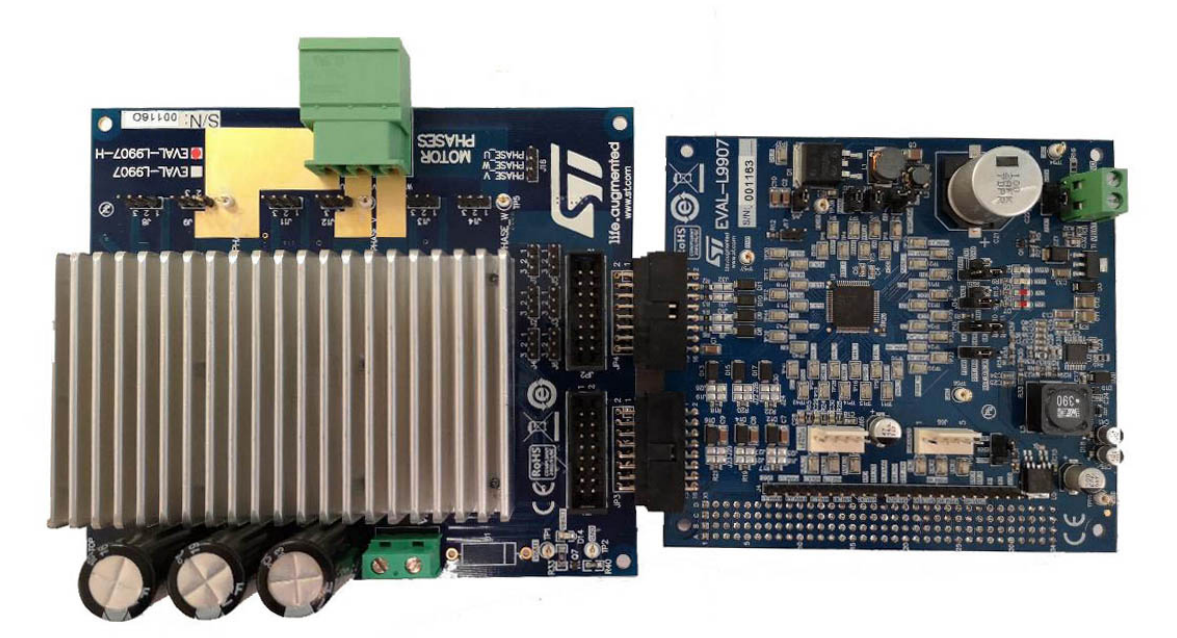
Figure 1. EVAL-L9907-H evaluation board